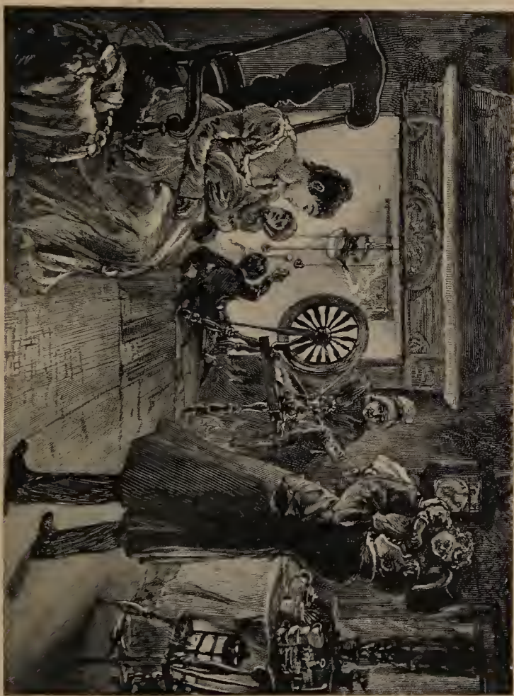
“ HE HEARD ITS SOFT TONES THROUGH THE COTTAGES CREEP ”